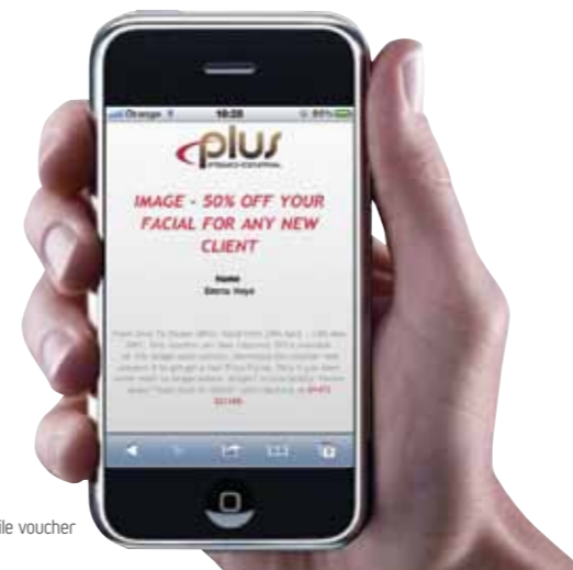
Typical mobile voucher

To see Ipswich Central Plus in action visit www.ipswichcentralplus.com